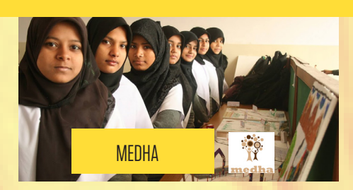
Est. 2011 | INDIA

22 ambassadors from APA's 2015 pioneer cohort graduated this year. Many have committed to another year of teaching. This past spring, APA selected 45 candidates from 700 applications to enter the 2017 two-year program.