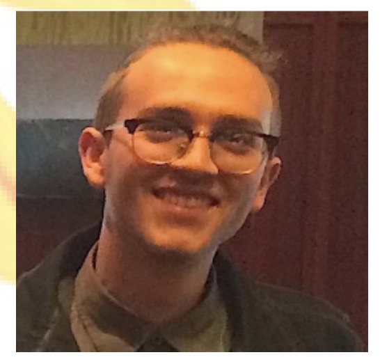
With our deepest sorrow and lasting love.