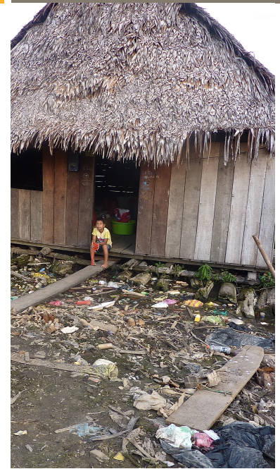
This boy from a slum in Peru could be learning, playing, thriving. We believe he deserves all the same chances we've had.

Check out our new blog, SEEDS OF HOPE , launching soon. Sign up on Skees.org .